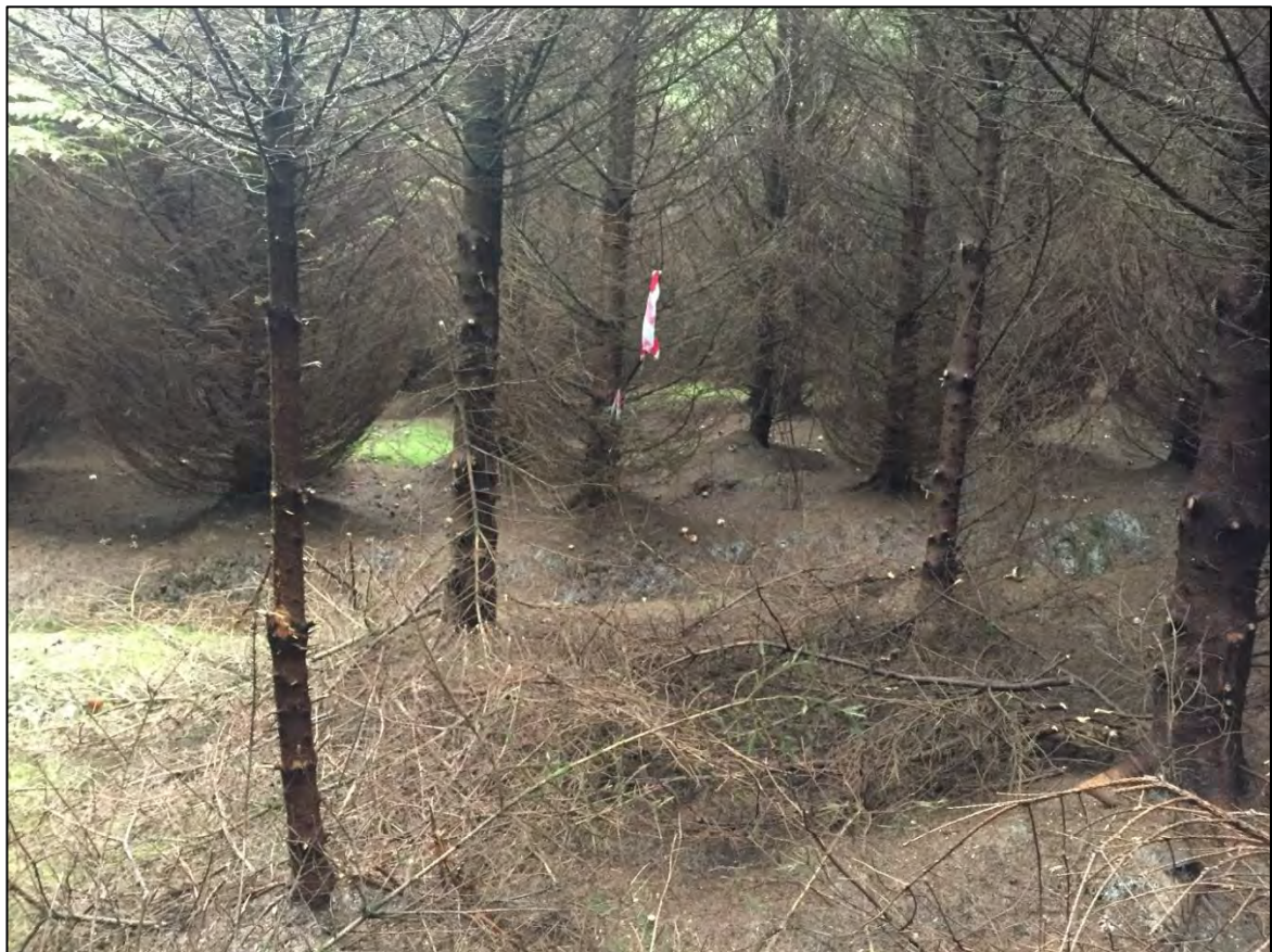
Plate 2-11 Example of Sitka spruce dominated forestry in the area in which the proposed infrastructure is located.