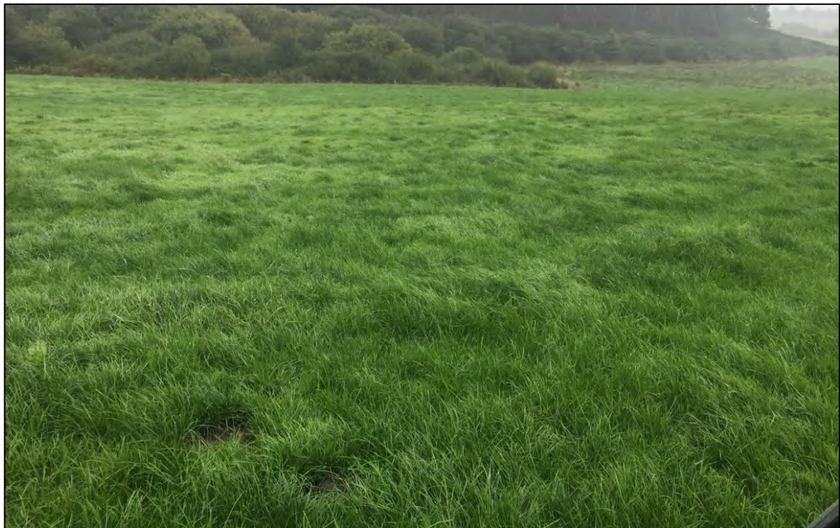
Plate 2-6 Example of improved agricultural grassland occurring within the study area.