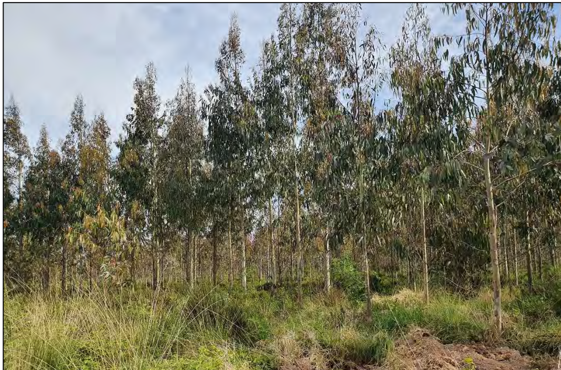
Plate 2-18 Example of Eucalyptus plantation occurring within the proposed site compound.