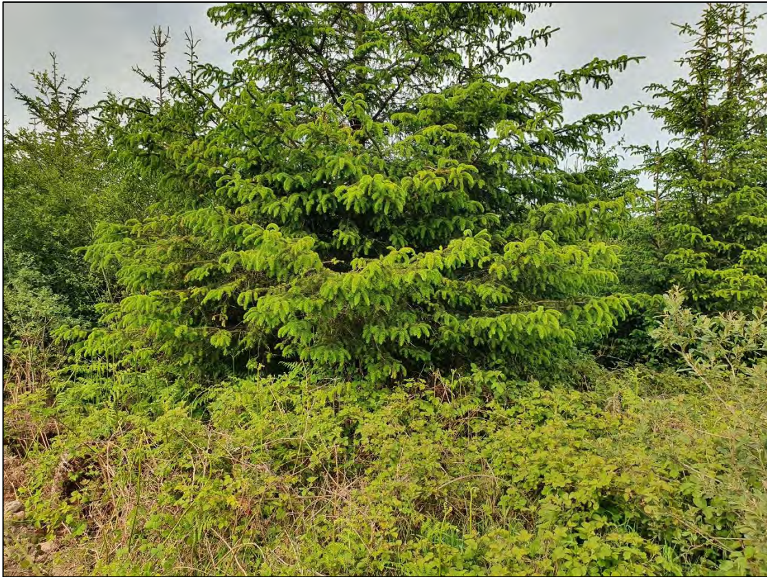
Plate 2-20 Example of Sitka spruce dominated forestry in the area in which the proposed infrastructure is located.