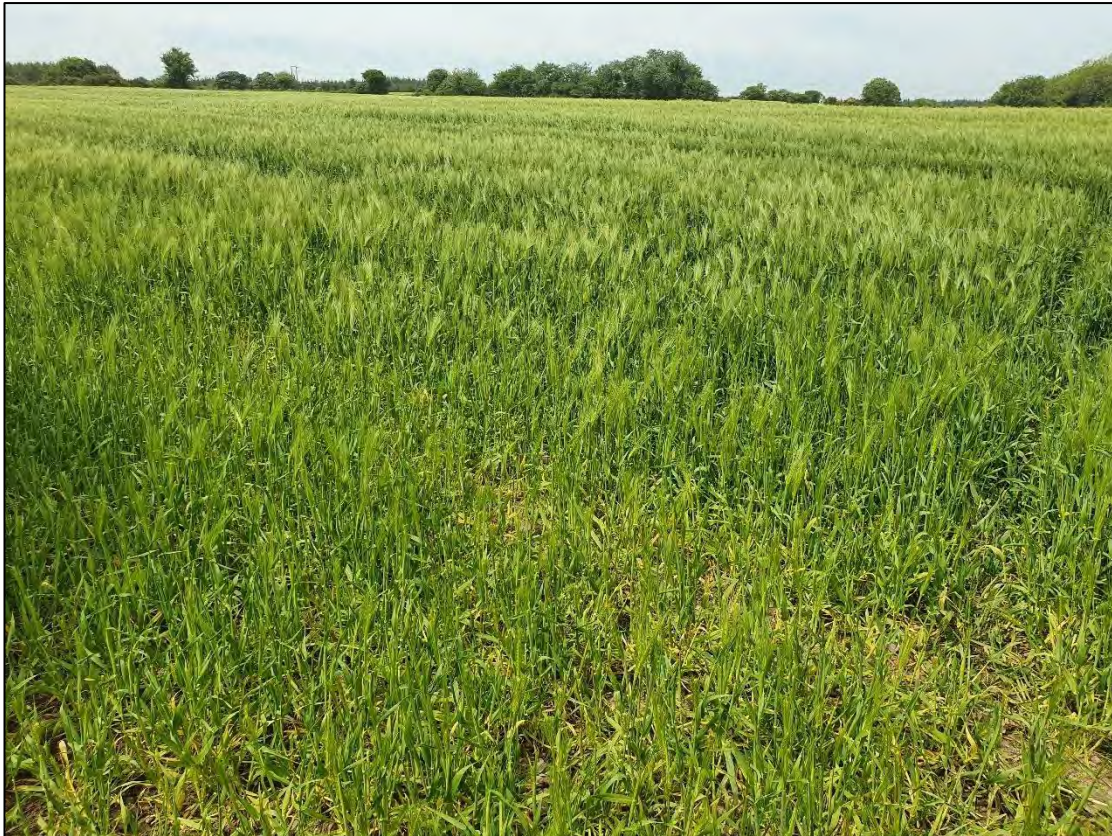
Plate 2-4 Example of arable lands occurring within the proposed development footprint.