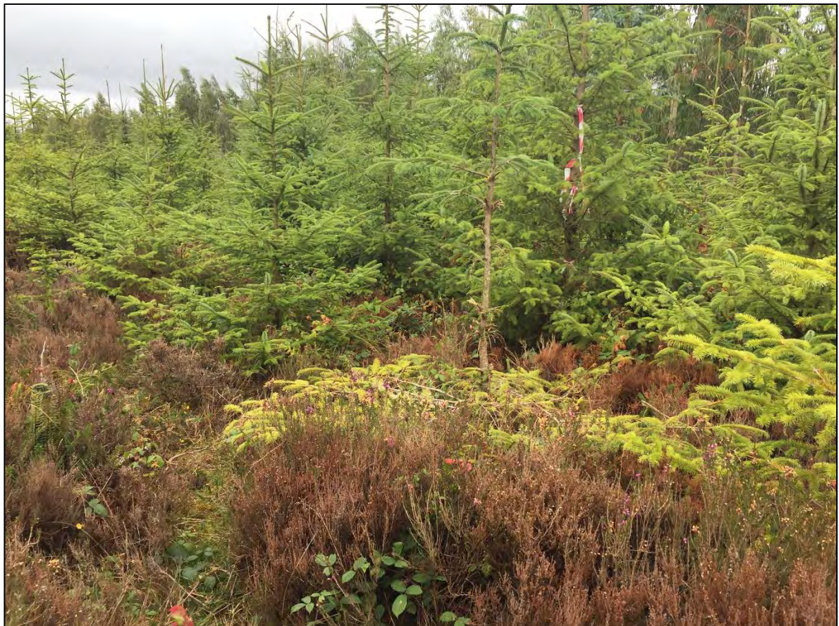
Plate 2-10 Example of second rotation Sitka spruce dominated forestry with Eucalyptus in the background.