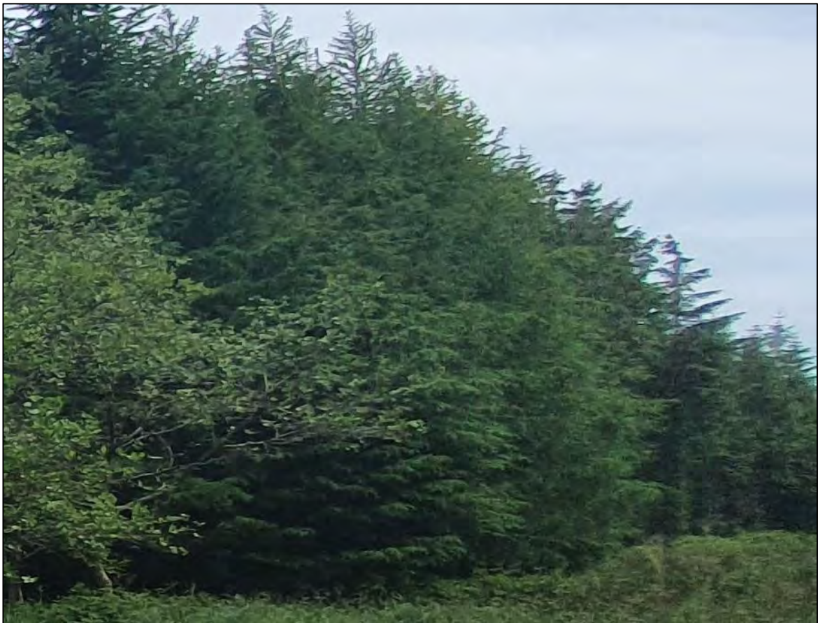
Plate 2-9 Example of Sitka spruce dominated forestry in the area in which the proposed infrastructure is located.