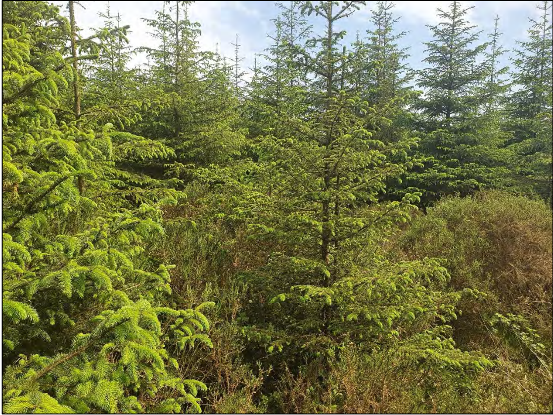
Plate 2-19 Example of Sitka spruce dominated second rotation forestry in the area in which the proposed infrastructure is located.