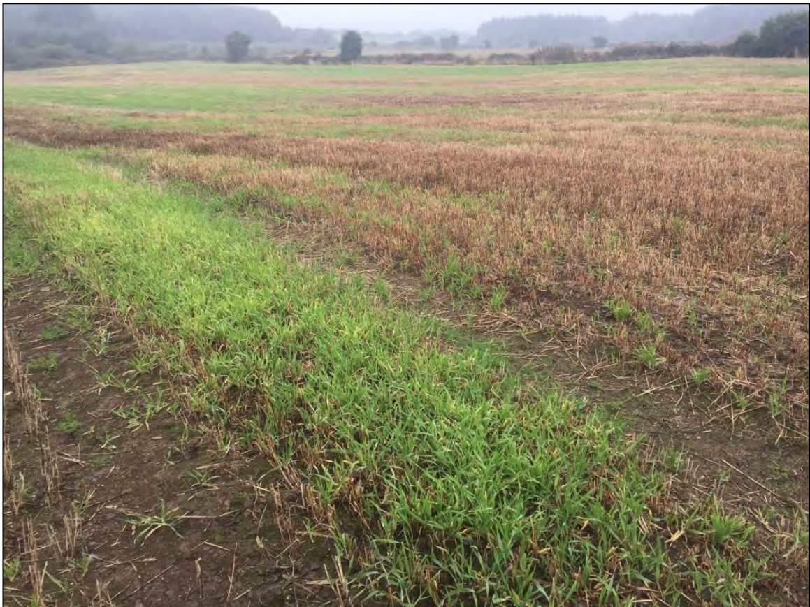
Plate 2-7 Example of arable crops (BC1) occurring within the proposed development footprint