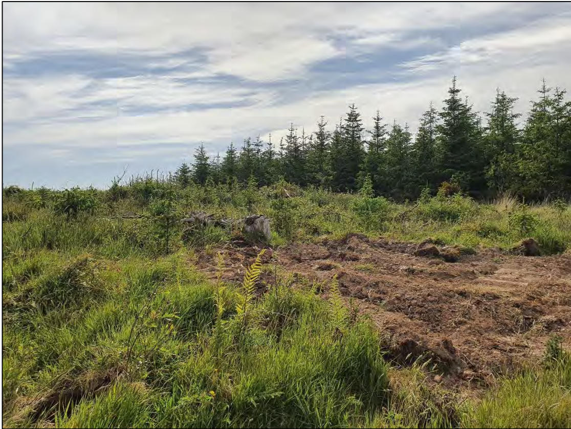
Plate 2-21 Example of Sitka spruce dominated second rotation forestry in the area in which the proposed infrastructure is located.