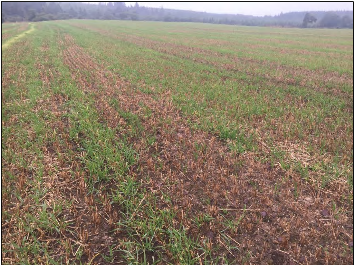
Plate 2-4 Example of arable crops (BC1) occurring within the proposed development footprint