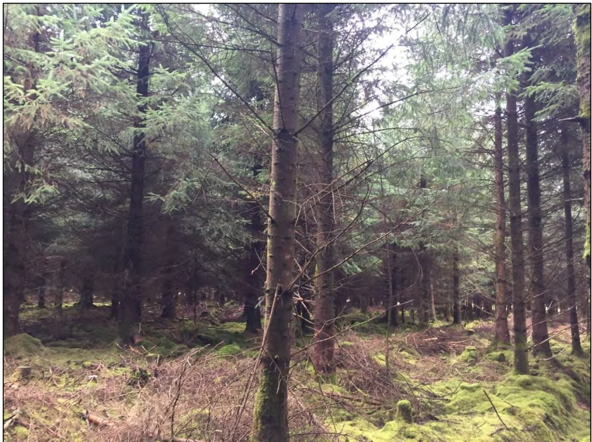
Plate 2-8 Example Sitka spruce dominated forestry in the area in which the proposed infrastructure is located.