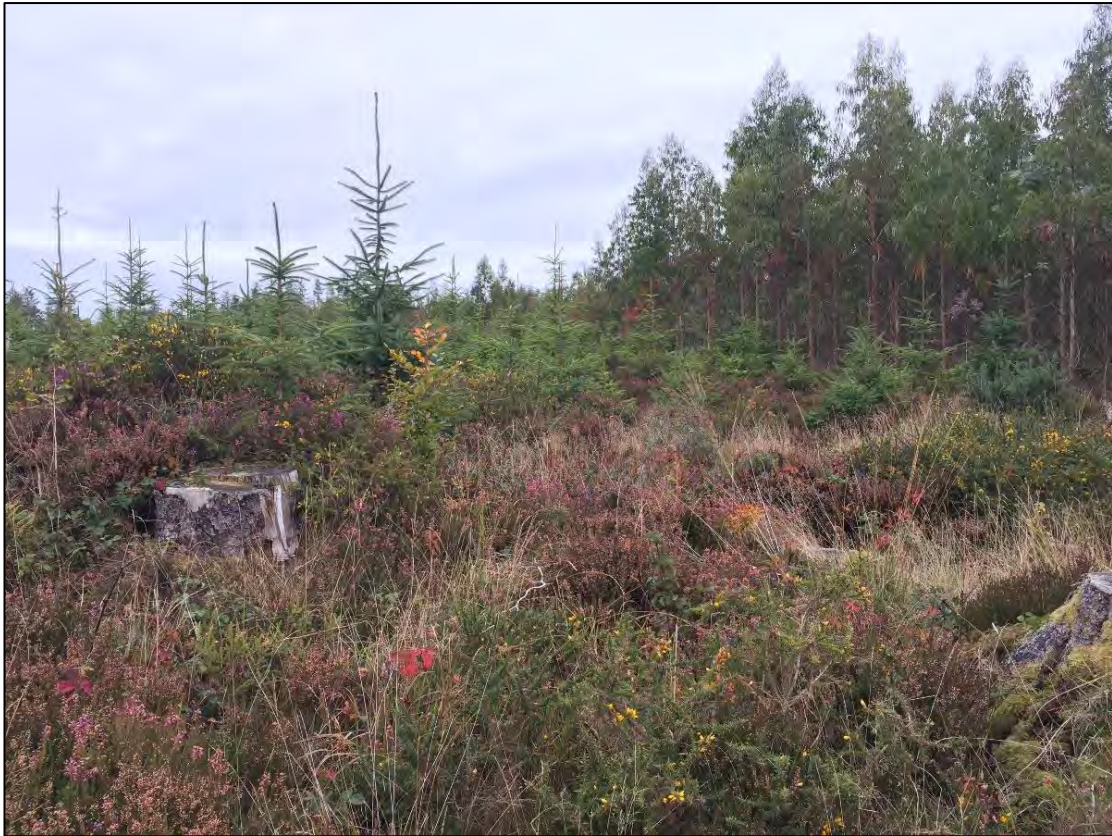
Plate 2-1 Example of second rotation conifer plantation (WD4), foreground and Eucalyptus plantation, right of background.