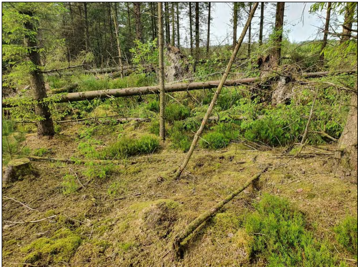
Plate 2-12 Access road to T12 with the turbine base located in the background within second rotation forestry.