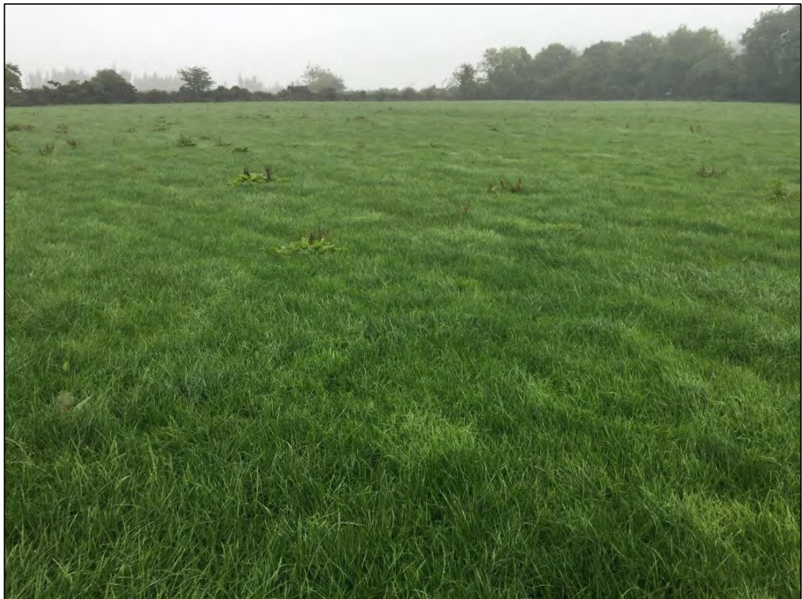
Plate 2-16 Example of improved agricultural grassland occurring within the study area.