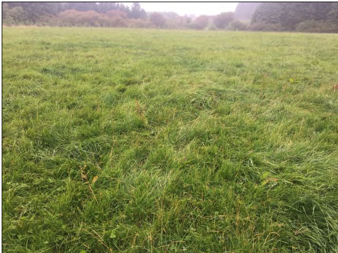
Plate 2-3 Example of improved agricultural grassland occurring within the study area.