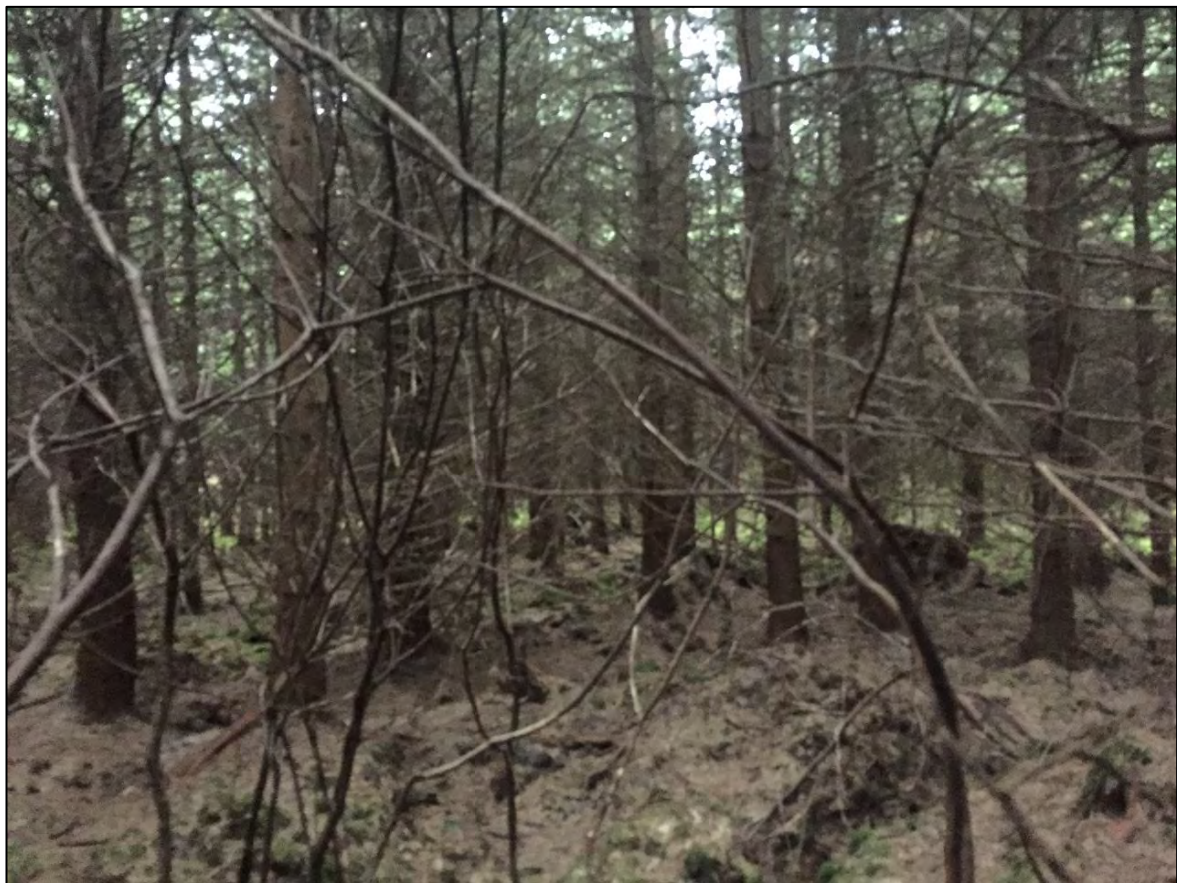
Plate 2-5 Example of Sitka spruce dominated forestry in the area in which the proposed infrastructure is located.