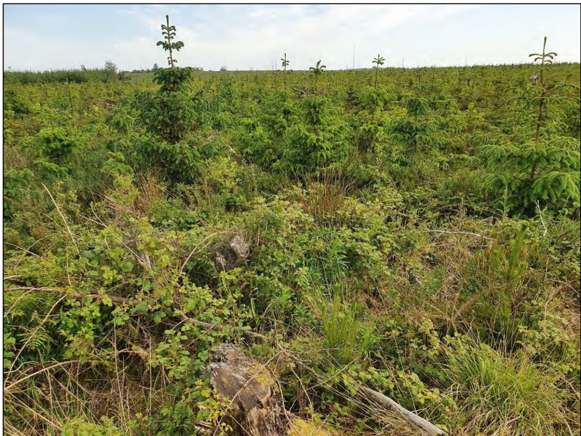
Plate 2-13 Second rotation forestry (WD4) at T13