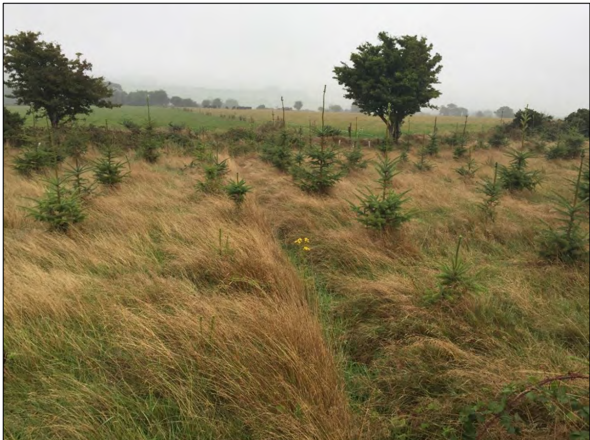
Plate 2-17 Recently planted forestry (WD4).