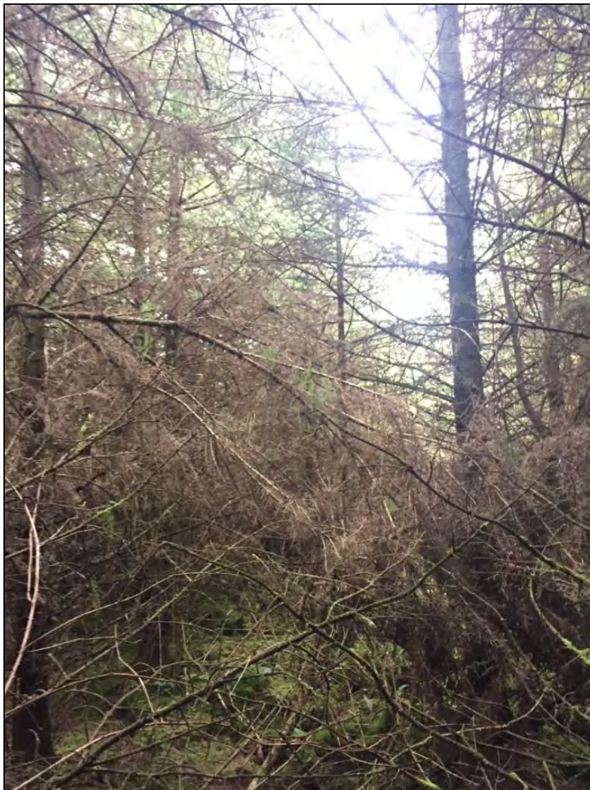
Plate 2-2 Example Sitka spruce dominated forestry in the area in which the proposed infrastructure is located.