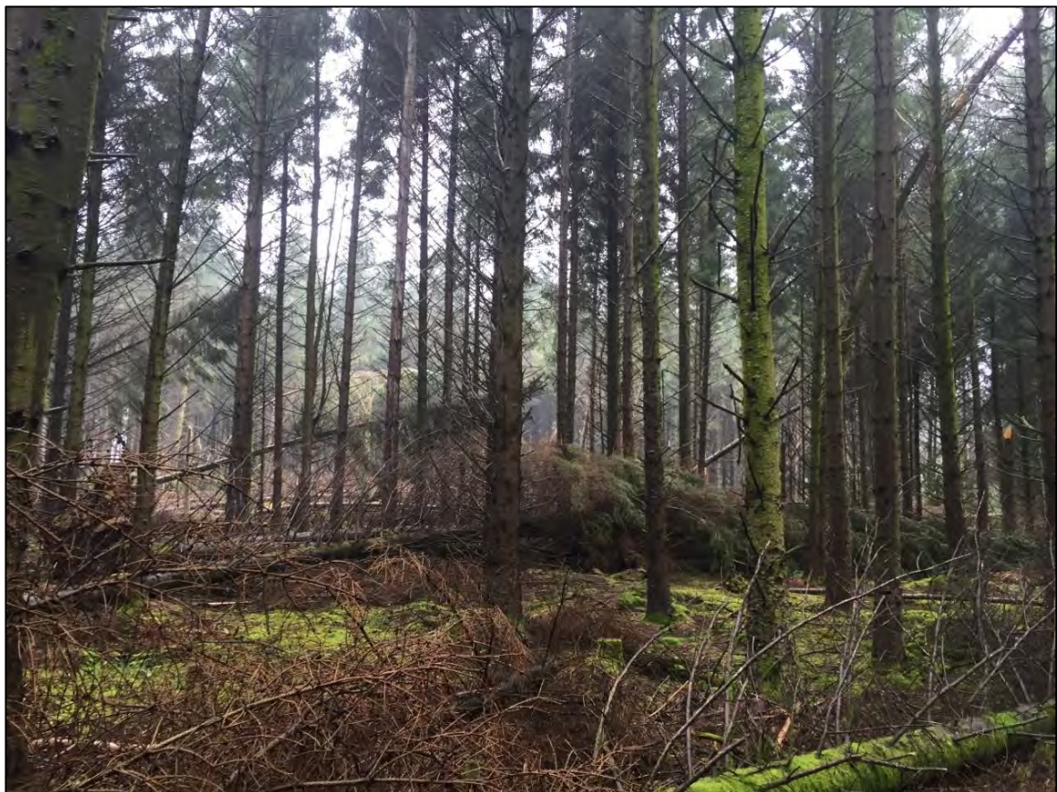
Plate 2-15 Example of Sitka spruce dominated forestry in the area in which the proposed infrastructure is located.